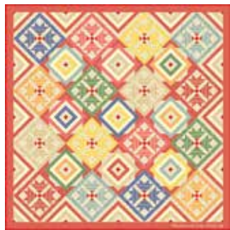
AJ 418 / AJ 418G Cross Check Size: 67" x 67"