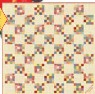
AJ 416 / AJ 416G Up a Row Size: 76" x 76"