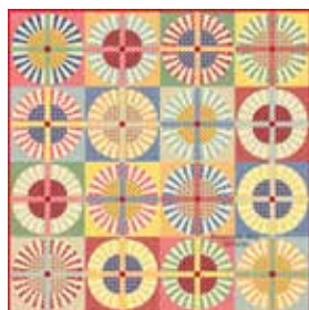
AJ 414 / AJ 414G Radiant Wheels Size: 56" x 56"