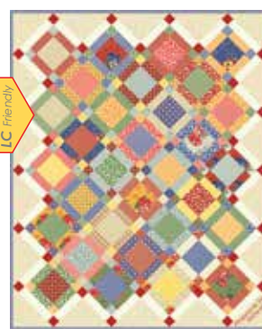
AJ 415 / AJ 415G Red Carpet Size: 48" x 59"