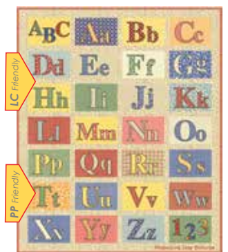
AJ 413 / AJ 413G ABC Letters Size: 43" x 52"